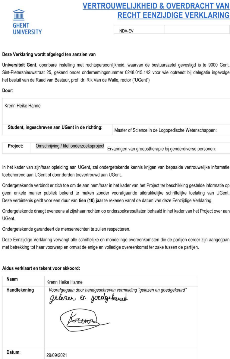
Fig. 2: Screenshot: Signed document 'Declaration of confidentiality and transfer of right' by author Krenn H.