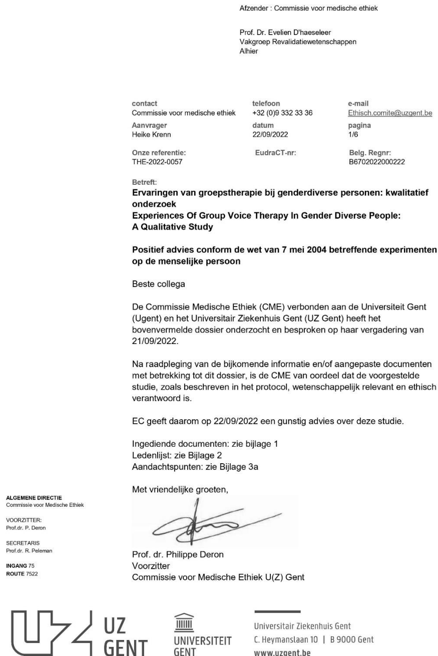
Fig. 1: Screenshot: Evidence of Ethics Committee submission and approval by the Ethics Committee by author Krenn H.